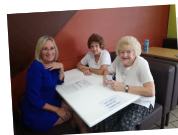
Speaking to constituents at my Open Surgery in McDonalds

It's always really important to keep right up to date with what's happening within the two Local Government Boroughs that make up my Constituency, so this month I also had one of my regular catch ups with both the Leader and Chief Executive of Gosport Borough Council and the Leader of Fareham Borough Council.