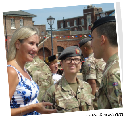
Attending 33 Field Hospital's Freedom of the Borough Parade

Back in the constituency, it was great to present Crofton Anne Dale Junior School students with their Citizenship Awards. I also judged St John's Primary School's Got Talent which was very tricky indeed as there were so many fantastic performances. I enjoyed a visit to Alver Valley School to meet with their Year 6 pupils and staff.