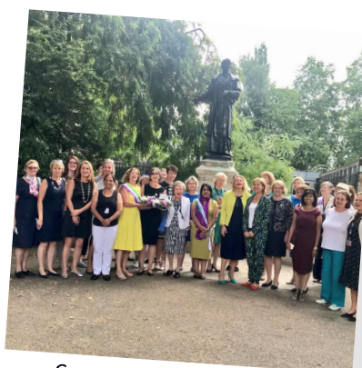
Commemorating Emmeline Pankhurst's birthday

It's hard to believe that July is over already! There's been a number of celebrations this month, with RAF100 showcasing a fantastic flypast over London and the 70 th Birthday of the NHS, which took me to Westminster Abbey for a Service celebrating how the NHS has transformed the health and wellbeing of our nation.