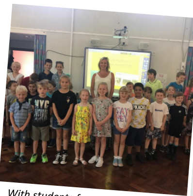
With students from Crofton Anne Dale Junior School