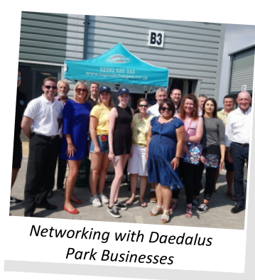
Networking with Daedalus Park Businesses

I met with The Willow Group GP Partnership and the local Clinical Commissioning Group this month to discuss many constituents concerns regarding appointments and issues with the telephone/online booking system. GP recruitment continues to be a big local issue but a number of positive actions were agreed.