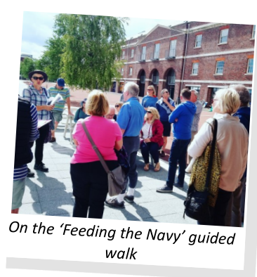
On the 'Feeding the Navy' guided walk

My Autumn Drop-In Surgeries took place this month at libraries and pubs across the constituency, it was great to meet so many residents - the hot topic was of course Brexit and the Prime Minister recently made a statement about the ongoing negotiations, which you can read here .