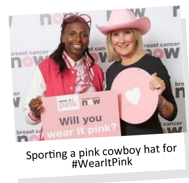
Sporting a pink cowboy hat for #WearItPink

I was delighted to visit the wonderful Naomi House and Jacksplace in Winchester. Back in the 1990s my super Mum sat on the fundraising committee that helped build this incredible local hospice and respite care facility for children and young people. It was great to see the results of all those who had worked so hard to provide it and meet the amazing team who run it and some of the incredible youngsters who benefit from it.