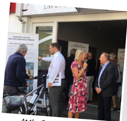
At the Gosport Police Station Consultation