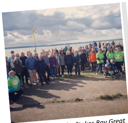
Volunteers at the Stokes Bay Great British Beach Clean