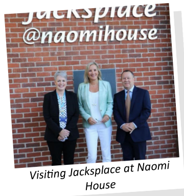
Visiting Jacksplace at Naomi House

I hosted a further Gosport Task Force meeting this month to plot a economic future for the Borough in light of the Government land that is earmarked for disposal. The Gosport Infrastructure Investment Plan we have been working on is nearing completion. Many residents have shown concerns regarding potential housebuilding in the strategic gap between Gosport and Fareham Boroughs so I was pleased to attend two public meetings which provided information about potential proposals.