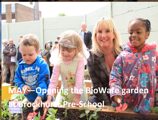
MAY —Opening the BioWare garden at Brockhams Pre-School