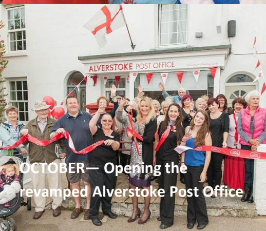
OCTOBER —Opening the revamped Alverstone Post Office