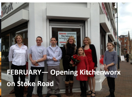
FEBRUARY — Opening Kitchenworx on Stoke Road