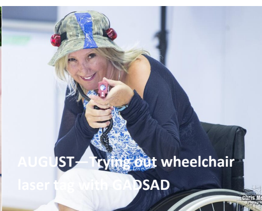
AUGUST —Trying out wheelchair laser tag with GADSAD