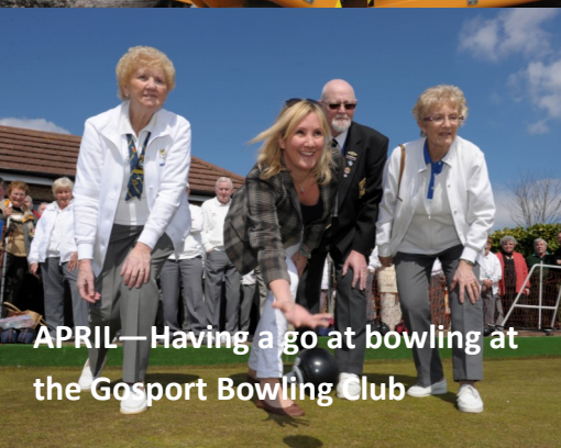
APRIL —Having a go at bowling at the Gosport Bowling Club