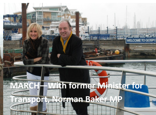
MARCH —With former Minister for Transport, Norman Baker MP