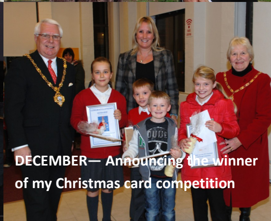
DECEMBER —Announcing the winner of my Christmas card competition