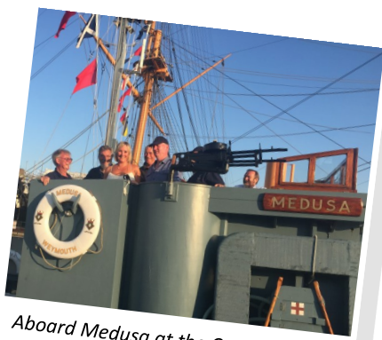
Aboard Medusa at the Coastal Forces centenary celebrations at Portsmouth Historic Dockyard