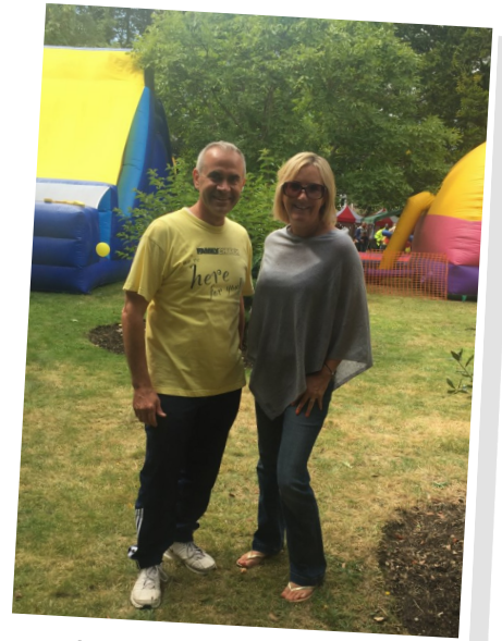
Gosport Family Church Fun Day