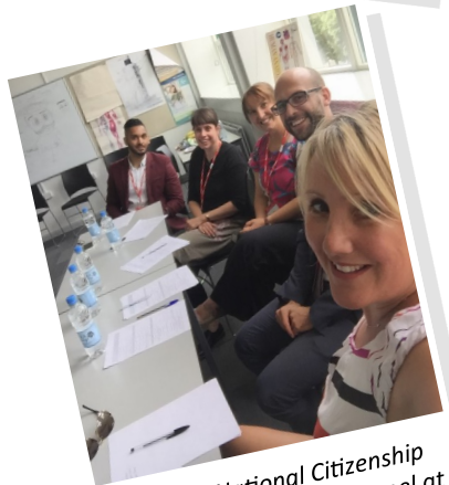
On the National Citizenship Service Dragon's Den panel at Fareham College