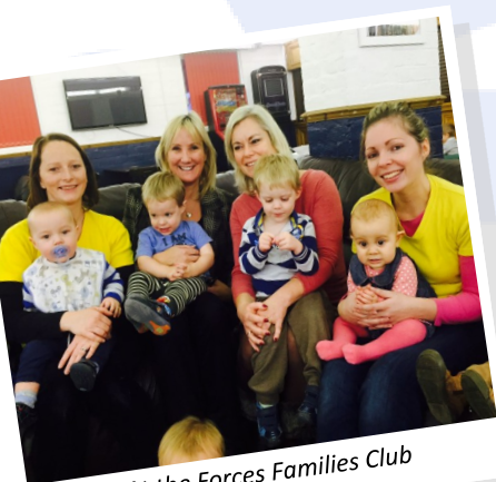
At the Forces Families Club

I visited the Forces Families Club at HMS Collingwood and met some of the delightful children and parents who make use of the crèche facilities – clubs