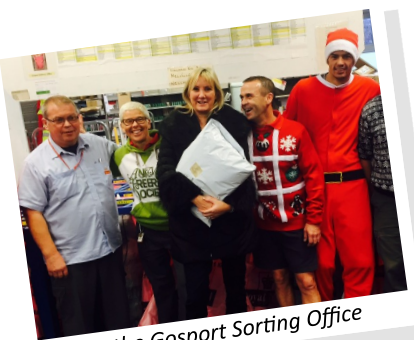
At the Gosport Sorting Office