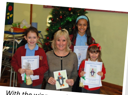
With the winner and runners up in my Christmas Card competition

Infrastructure improvements are crucial to this growth so I met the roads Minister, Robert Goodwill MP to ask him to support the Solent Local Enterprise Partnership's £30M funding bid to complete a new access road to our peninsula. The decision will be announced in the New Year – fingers and toes firmly crossed! I also met with the Minister responsible for local bus services, Baroness Kramer, along with Hill Head residents, to discuss the adverse changes to bus provision across our area.