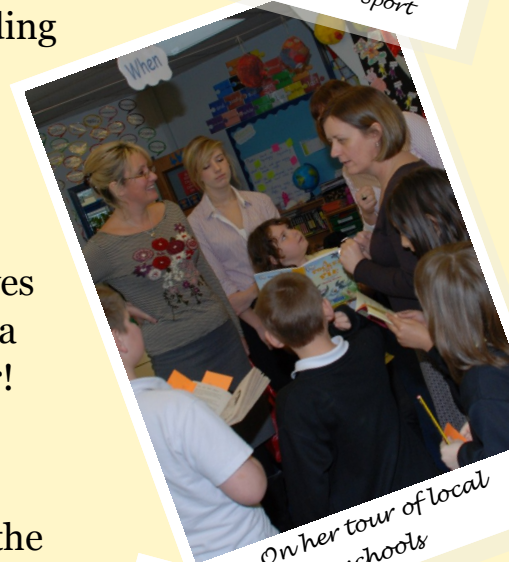
On her tour of local schools