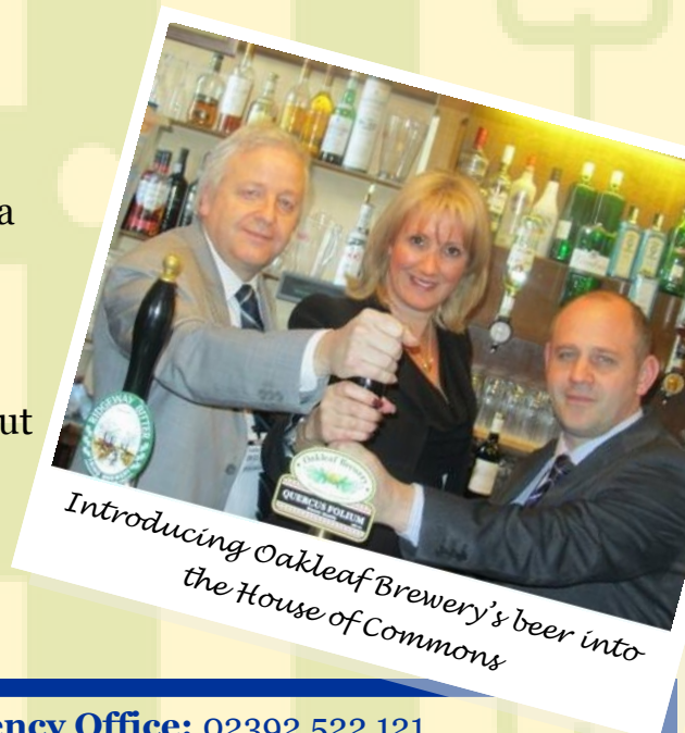
Introducing Oakleaf Brewery's beer into the House of Commons