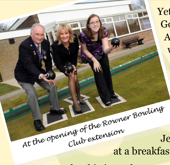
At the opening of the Rowner Bowling Club extension

Yet despite all this great work, further challenges lie ahead for Gosport. I recently met with the CEO of the Maritime Coastguard Agency to discuss the future of the Coastguard in our area. I'm working to secure a commitment that the Coastguard will continue to be based around Gosport. I also held a very constructive meeting with Babcock, who manage our military estates, to see how we can maximise their use. I had a useful meeting with the Detention Forum regarding Haslar Immigration Detention Centre. And I took the chance to quiz the Secretary of State for Culture, Media & Sport, Jeremy Hunt, about the School Sports Partnership, when I spoke at a breakfast meeting for him in Farnham.