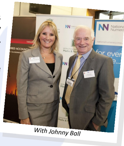
With Johnny Ball

The launch of my Parliamentary Group on Maths & Numeracy took place this month and was a huge success. Education Minister, Liz Truss MP, gave the key note address and an icon of children's TV, Johnny Ball ( Think of a Number ), pledged his support to our campaign to boost numeracy in the UK.