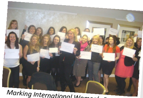
Marking International Women's Day with local business women