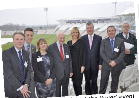
With delegates at a 'Meet the Buyer' event at the Ageas Bowl