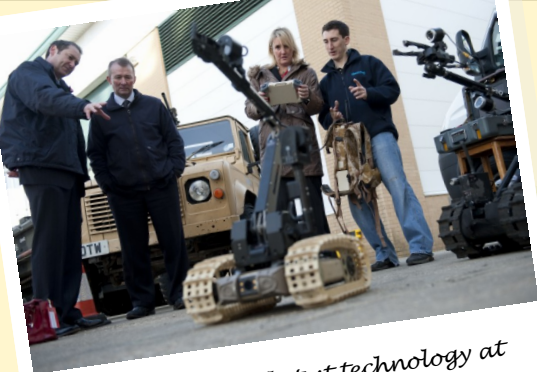
Testing out the latest technology at QinetiQ

On a more sombre note, I had the honour of attending the Gosport Civic Remembrance Service, laying a wreath to honour all those who have paid the ultimate sacrifice in service of our country.