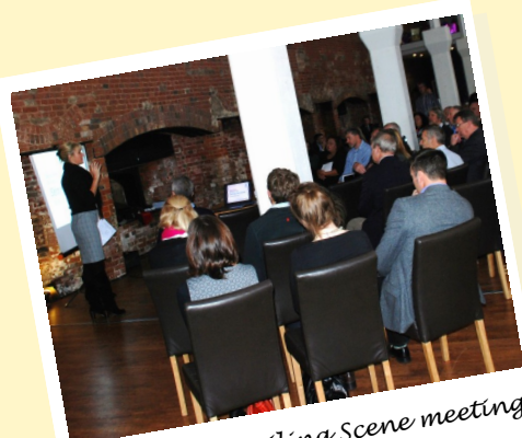
Addressing Sailing Scene meeting at Clarence Marina